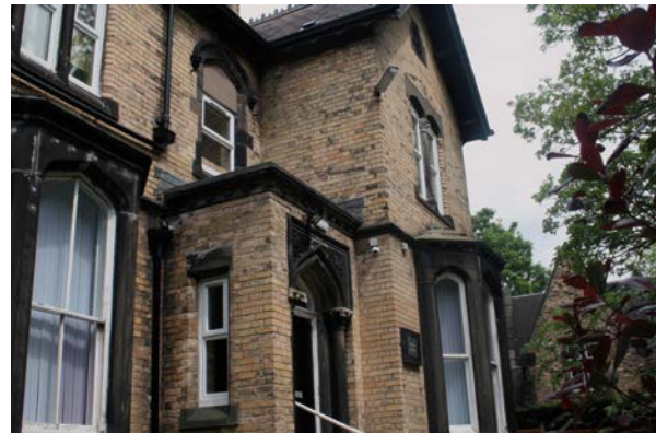
Stoke Recovery House