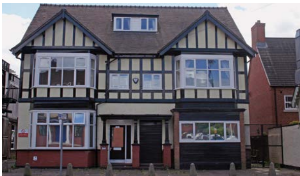
Cannock Recovery House