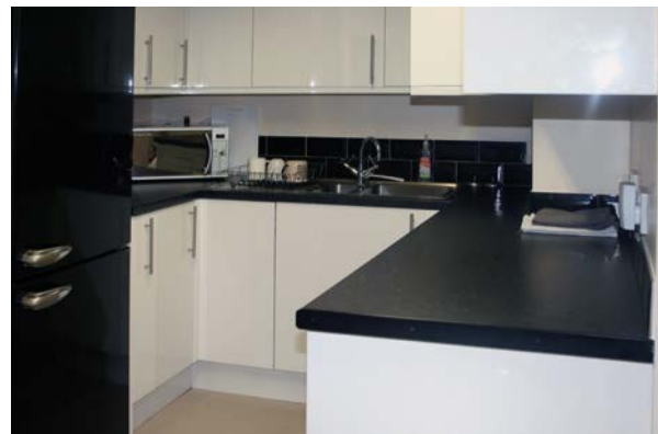
Kitchen at Stoke